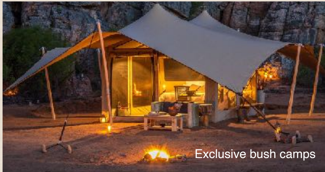
Exclusive bush camps