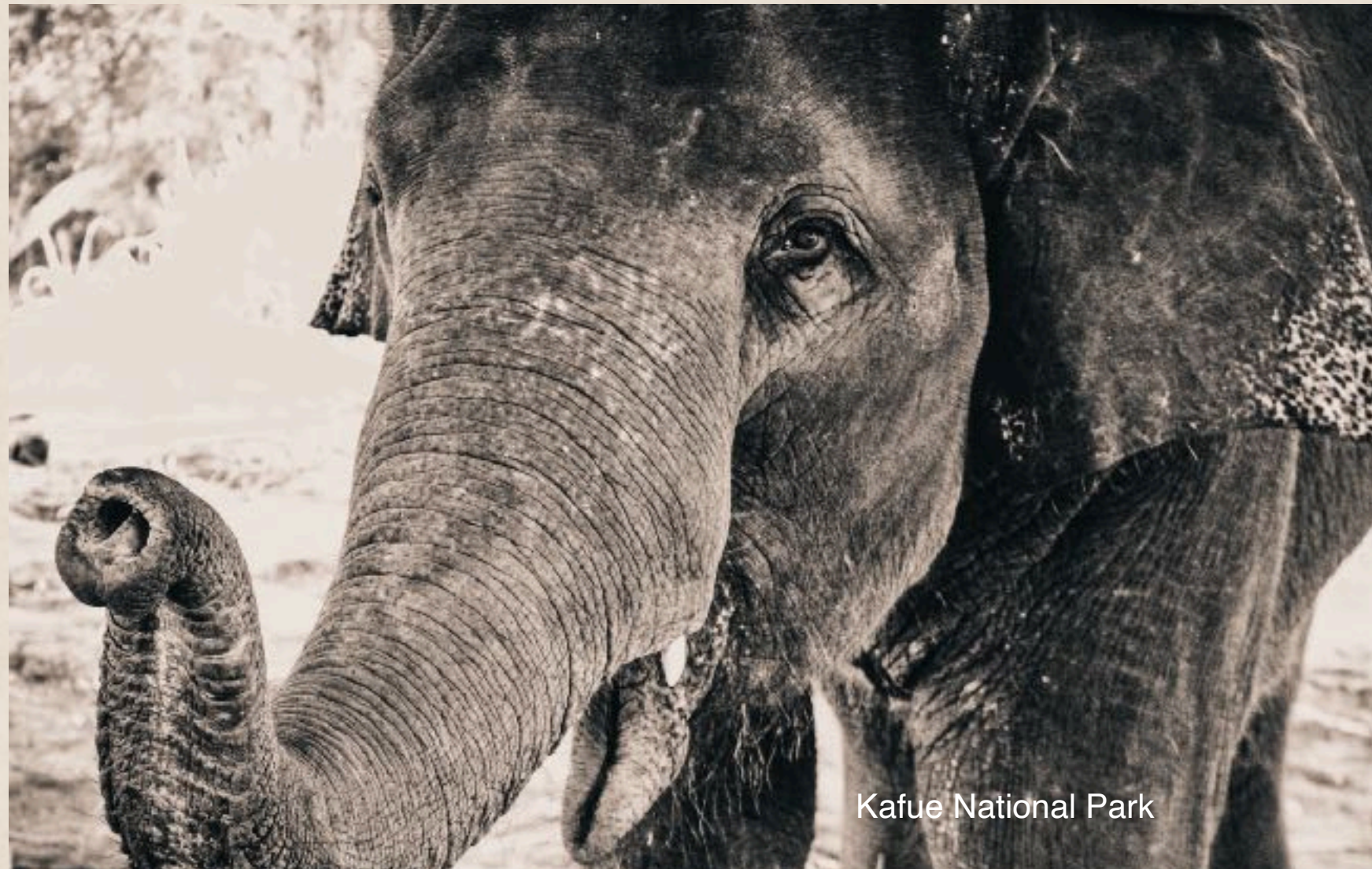
Kafue National Park

Our vehicle will pick you up from your accommodation in Livingstone at 06,30 and departure for a 120km transfer on tarmac road to Kalomo. Here, we will take a gravel road for 80km to the Southern Gate of the National Park. (Dumdumwezi). We will then proceed north inside the National Park on a new gravel road until we will reach