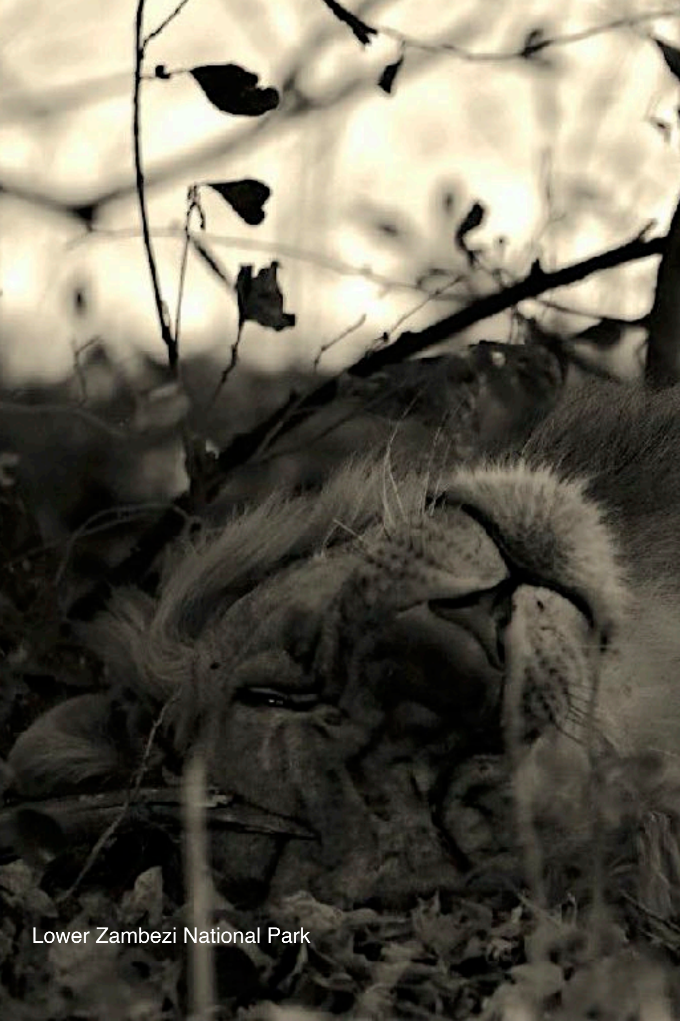
Lower Zambezi National Park

Very early wake and sunrise breakfast at 05.30 at the lodge. At 06.00 a.m. our minibus will pick you up to start a transfer to Mfuwe – South Luangwa National Park (700km of tarmac road – approximately 11 hours). Lunch break along the way depending on time (e.g. traditional Zambian meal at a local tavern).