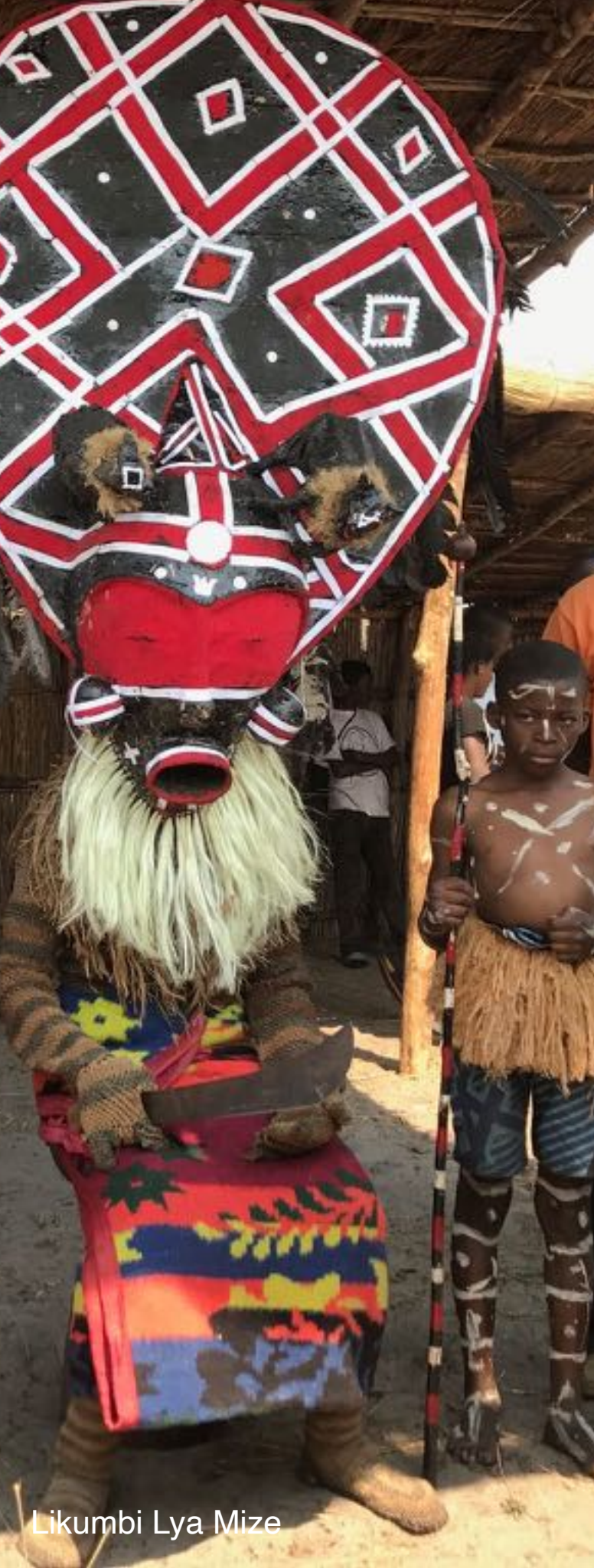
Likumbi Lya Mize