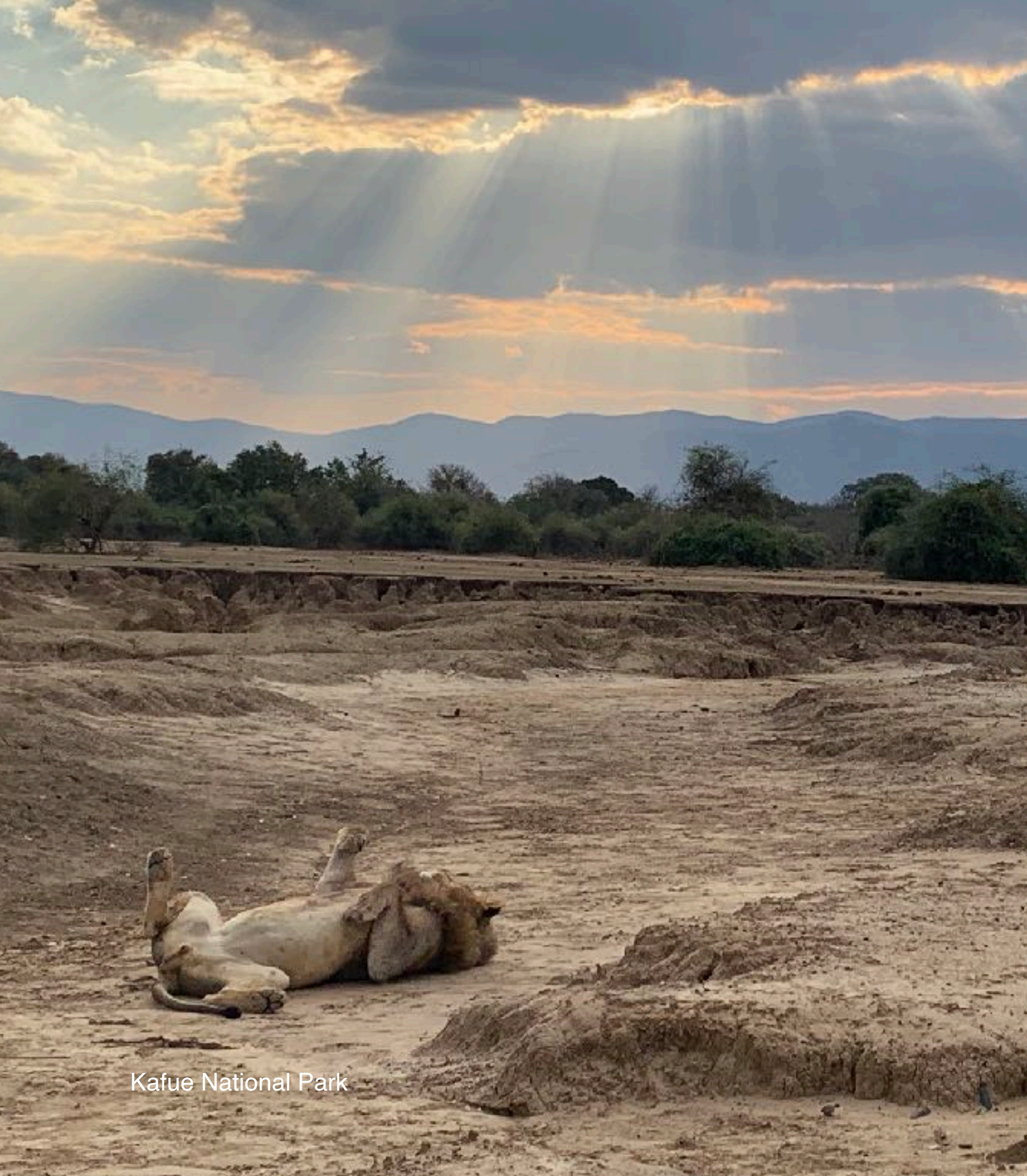
Kafue National Park

Wake up at sunrise and breakfast. Break of camp and departure along the Spinal road inside the National Park proceeding north with good opportunities to spot wildlife along the way.