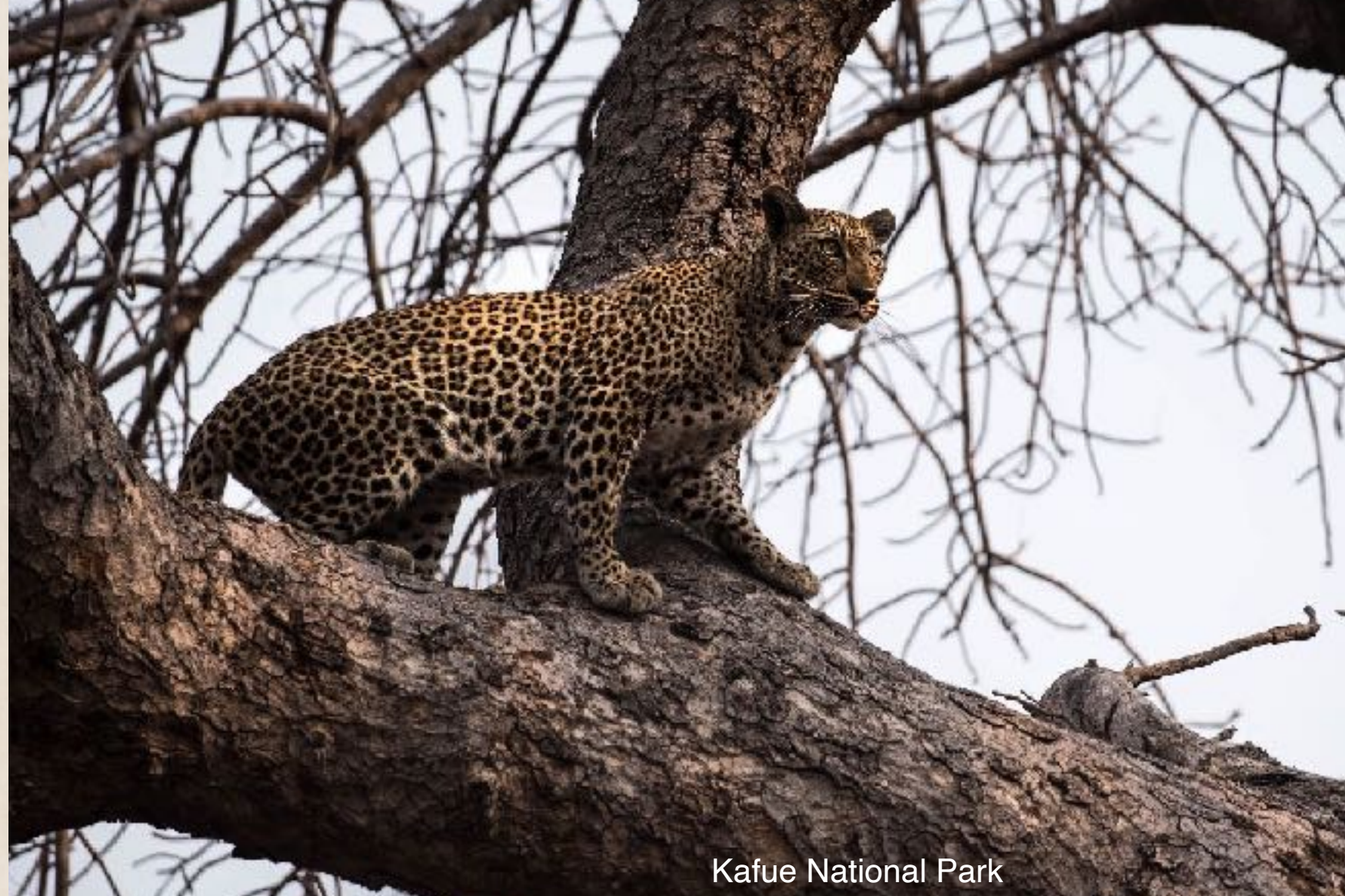
Kafue National Park

Day 2: Kafue National Park – Busanga Plains (Travel distance: 370km / 7 hr – Tarmac Road + Bush Trails)*