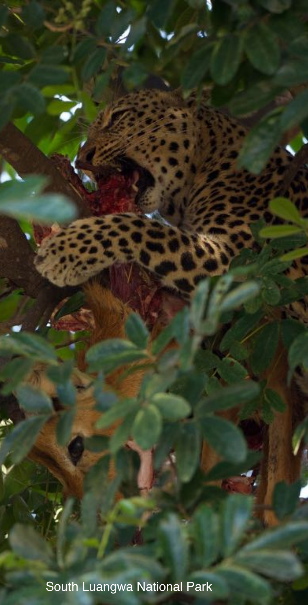
South Luangwa National Park

Alternatively, guests can choose other activities such as half-day boat safari + half day fishing, village tour, birding tour, etc. It is also possible to organise a full day Game Drive in the National Park at a supplement.